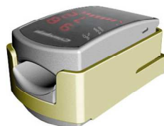
Order No. MD-650P-LY