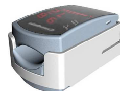
Order No. MD-650P-LB