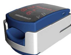
Order No. MD-650P-DB