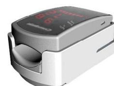
Order No. MD-650P-LG